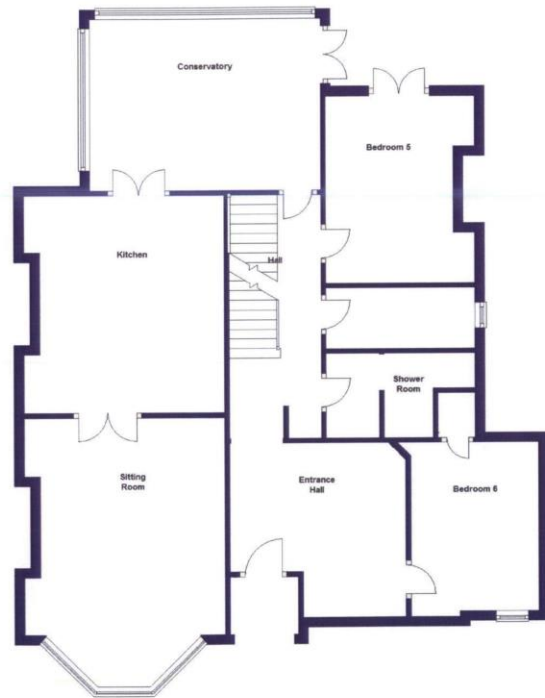
Ground Floor Approx. 106.8 sq m (1,150 sq ft)